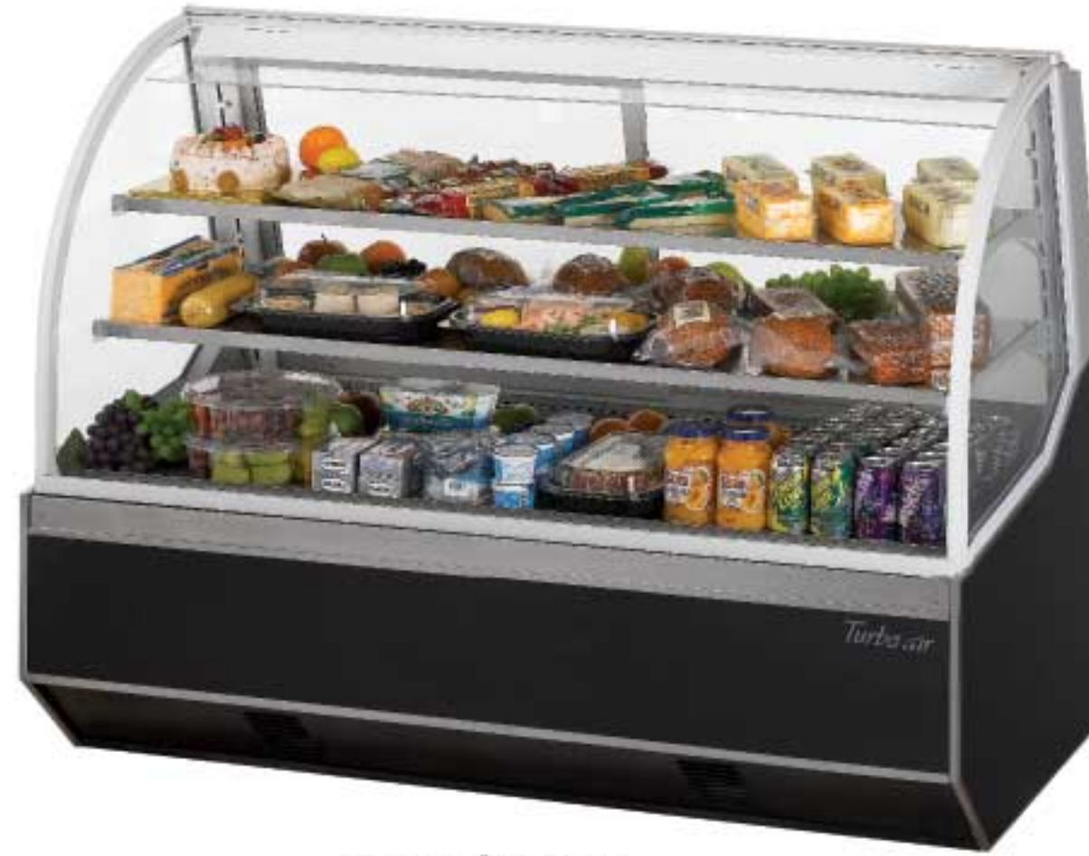
TD-4R / TD-5R